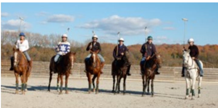
Last Intro Clinic game of the Season